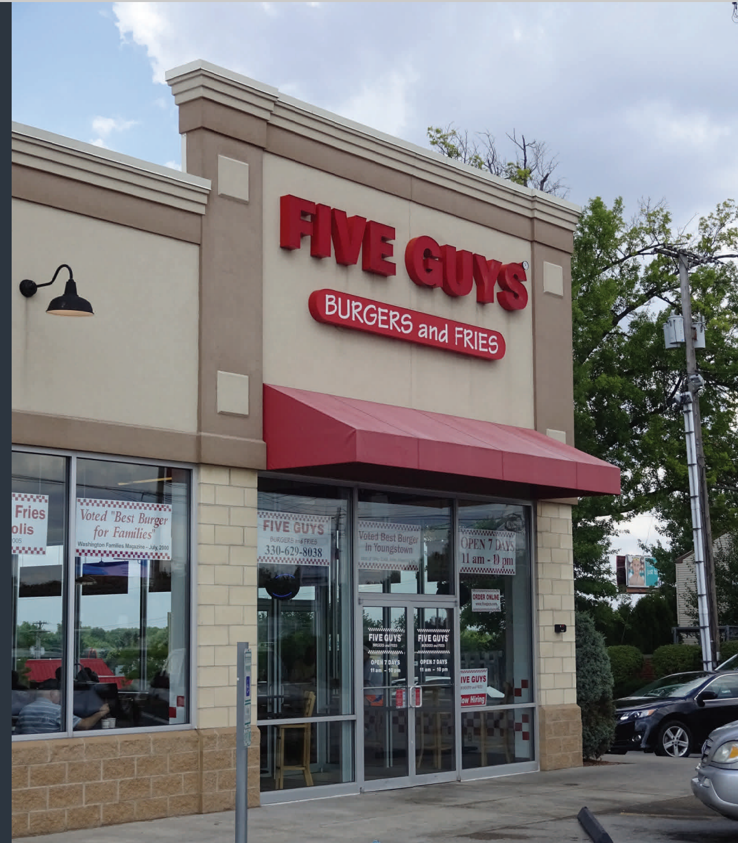
Representative photo only - not actual property