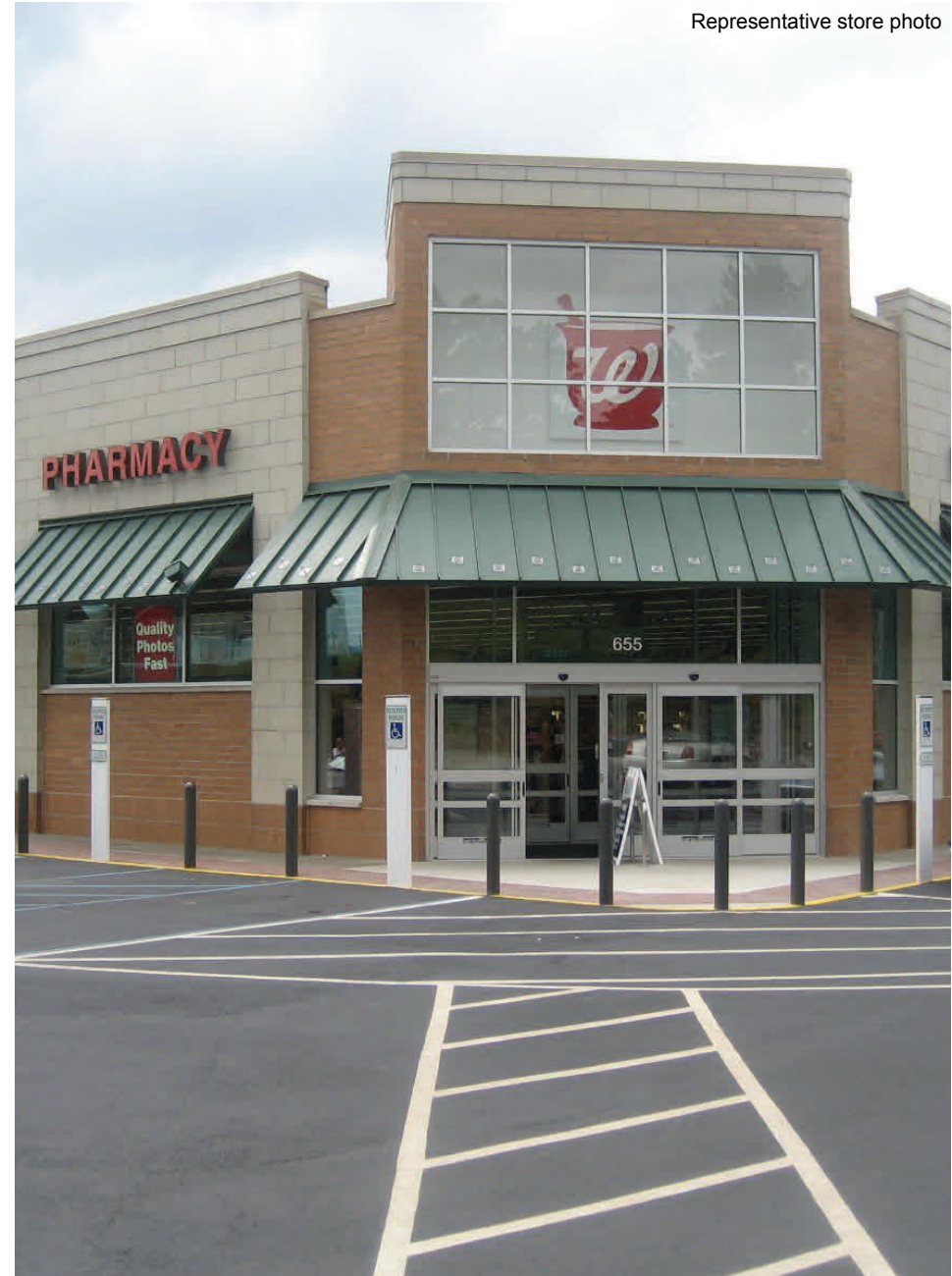
Representative store photo