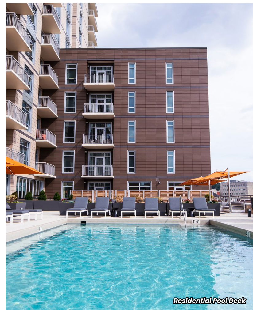
Residential Pool Deck