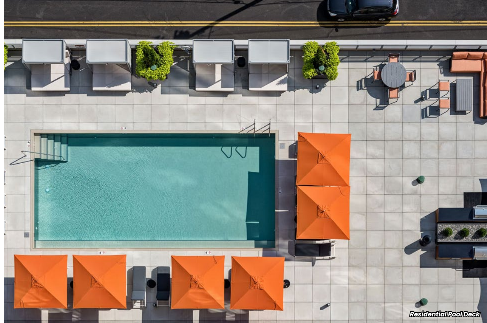
Residential Pool Deck