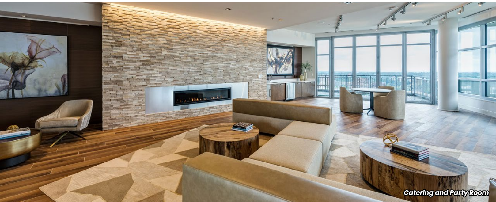
Catering and Party Room