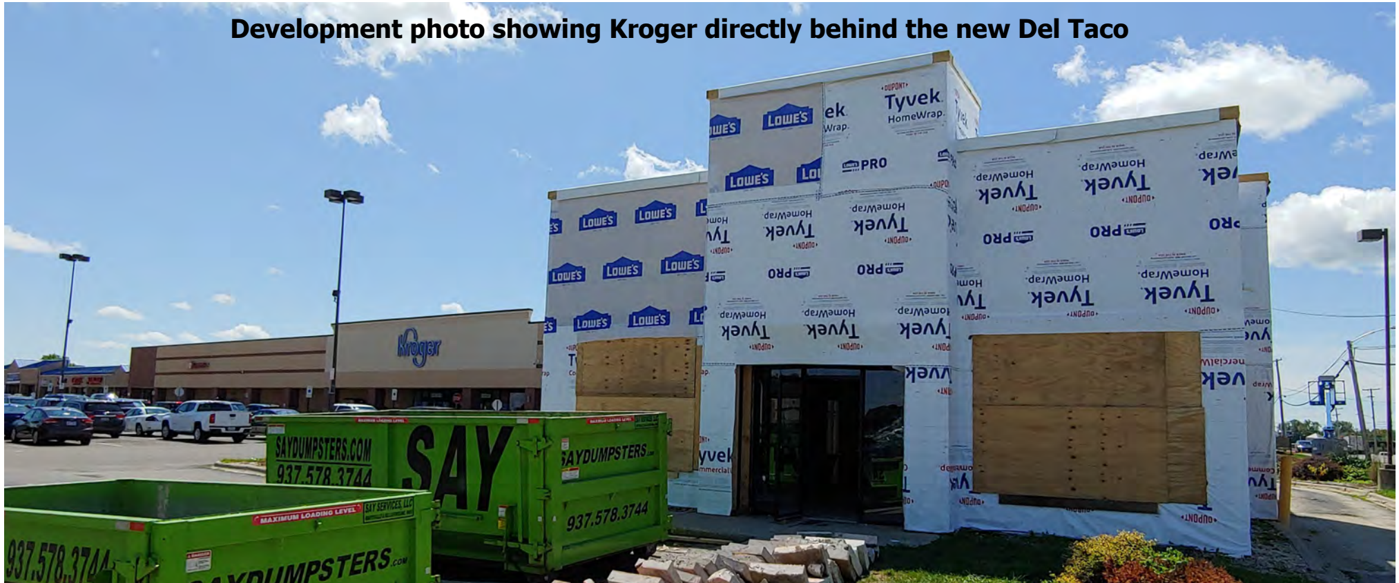
Development photo showing Kroger directly behind the new Del Taco