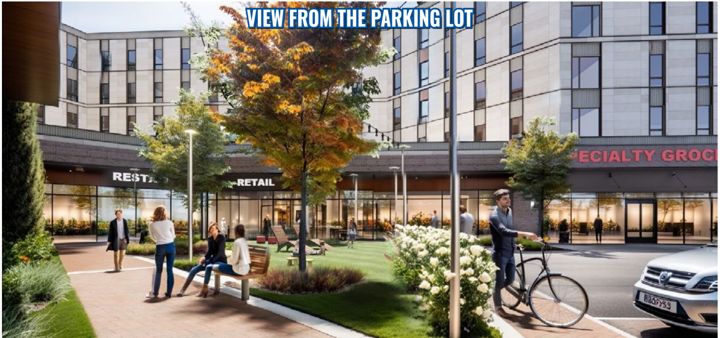
VIEW FROM THE PARKING LOT