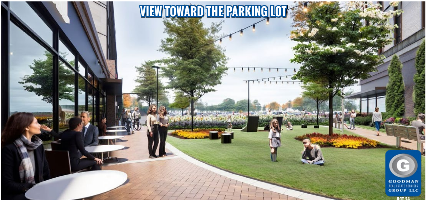
VIEW TOWARD THE PARKING LOT